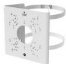
SN-CBK627D Pole Mount